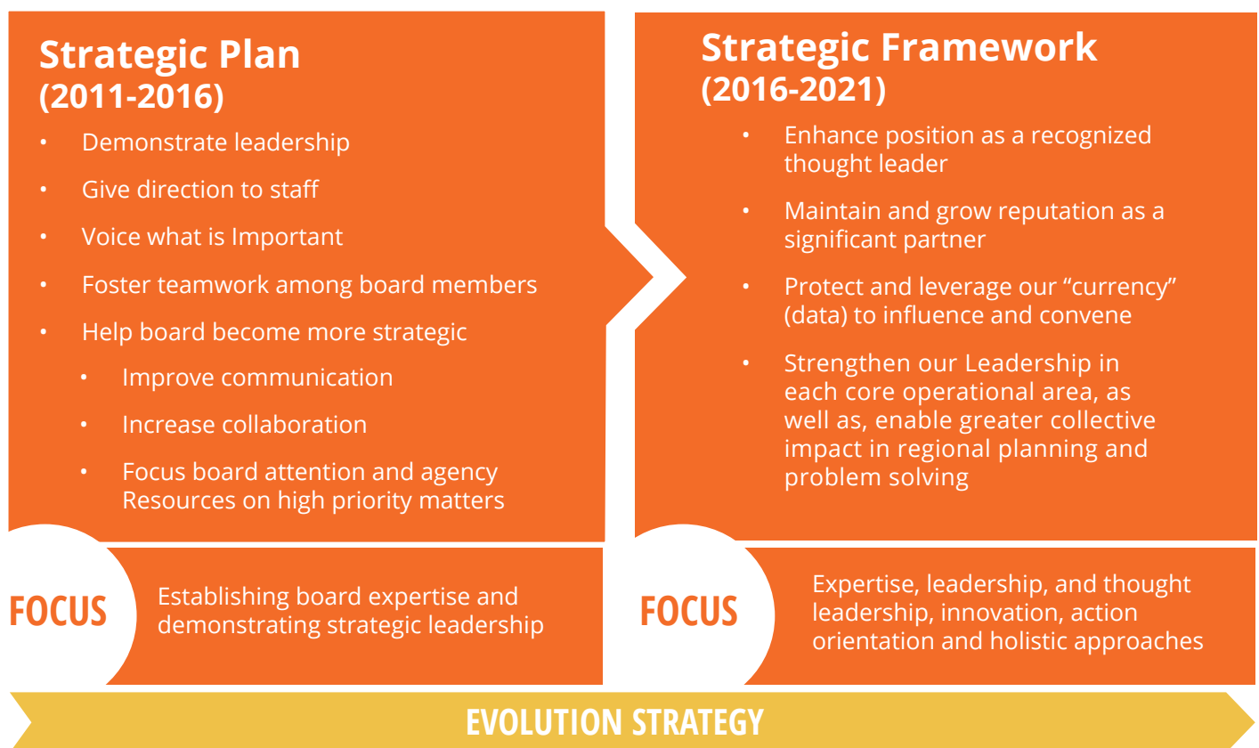
FIGURE 1: The Evolution Strategy principles were implemented in 2012 and now serve to guide the development of the 2016 Strategic Framework.

Atlanta is one of the world's most dynamic metropolitan areas, competing globally on the strength of its resilience, diverse population, robust economy, cultural assets and attractive lifestyles. The dynamic nature of our region, along with increasingly rapid regional and national change creates higher levels of uncertainty. The Atlanta Regional Commission can expect greater levels of scrutiny as a broader set of variables are pulled into play, our sphere of influence widens, and as various community leadership and policymaking arrangements are negotiated in this shifting landscape.