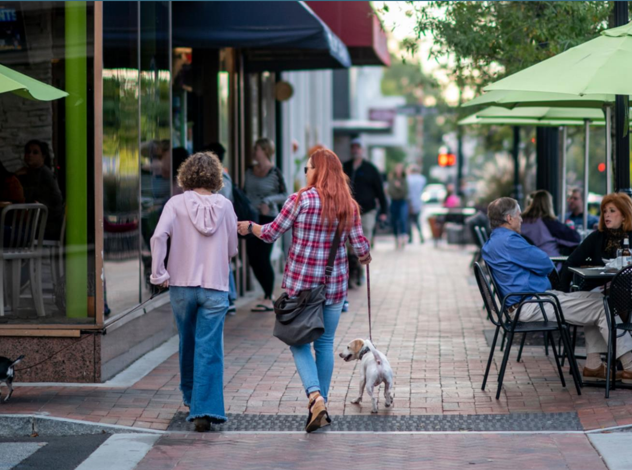
MAIN STREETS & DOWNTOWNS