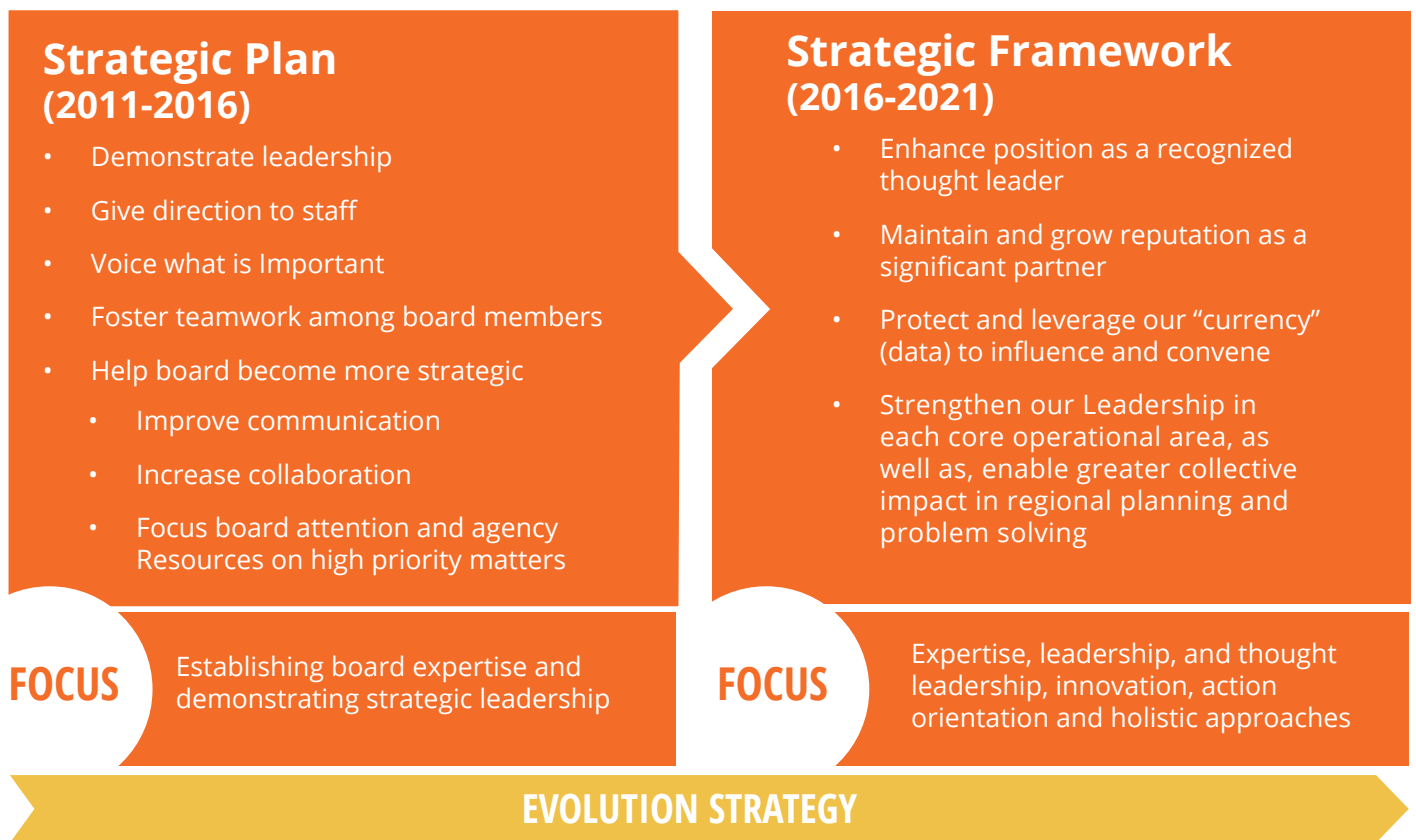
FIGURE 1: The Evolution Strategy principles were implemented in 2012 and now serves to guide the development of the 2016 Strategic Framework.

Atlanta is one of the world’s most dynamic metropolitan areas, competing globally on the strength of its resilience, diverse population, robust economy, cultural assets and attractive lifestyles. For the Atlanta Regional Commission this means greater numbers of variables are pulled into play, increasing levels of scrutiny, our sphere of influence widens and perceptions of and contests for power arrangements unfold.