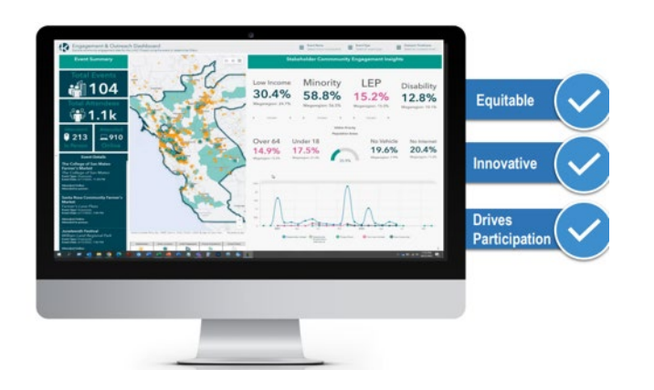
Transit Dependent/ Underserved Population Outreach