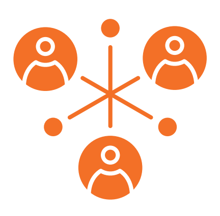
Service Provider Outreach Stakeholder, Service Provider, and HST Engagement