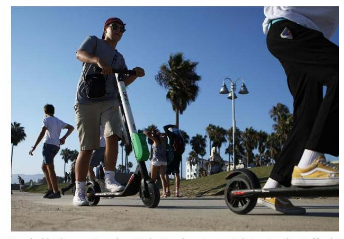
People ride Lime scooters along Venice Beach on August 13 in Los Angeles, California.

① Updated 10:45 PM ET, Thu August 16, 2018