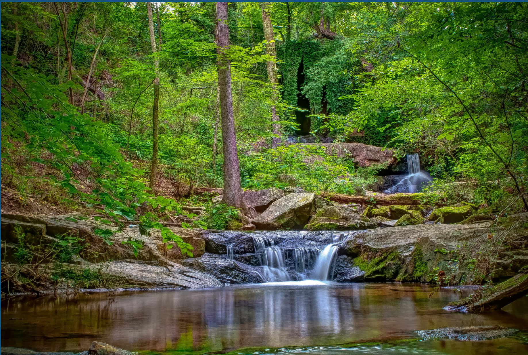
Cascade Springs Nature Reserve